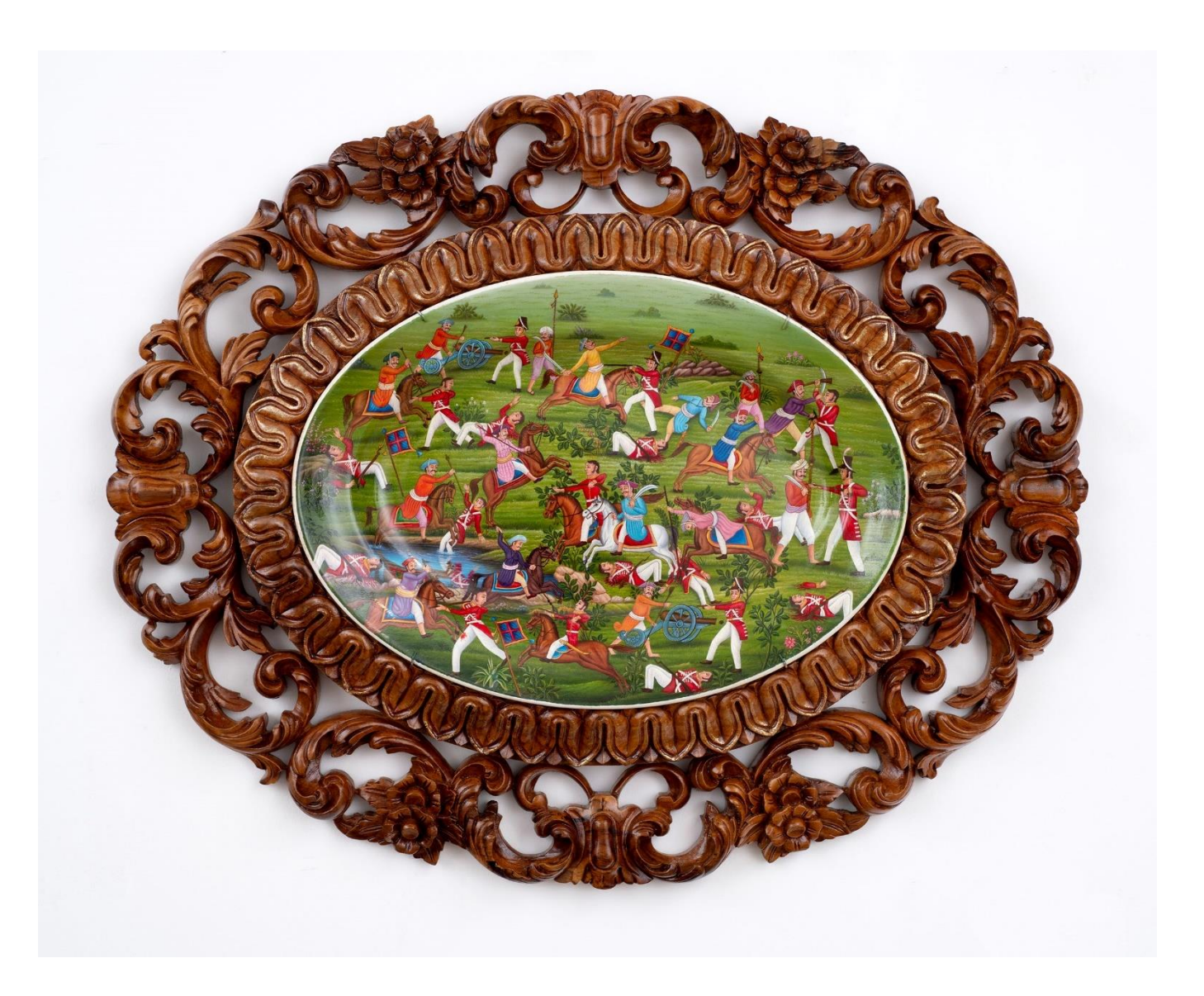
4. On the plains of Pollilur 1784, 2023-24

Found vintage ceramic plate, hand painted with enamel paint and lacquer 34.3 \times 48.3 \text{ cm}