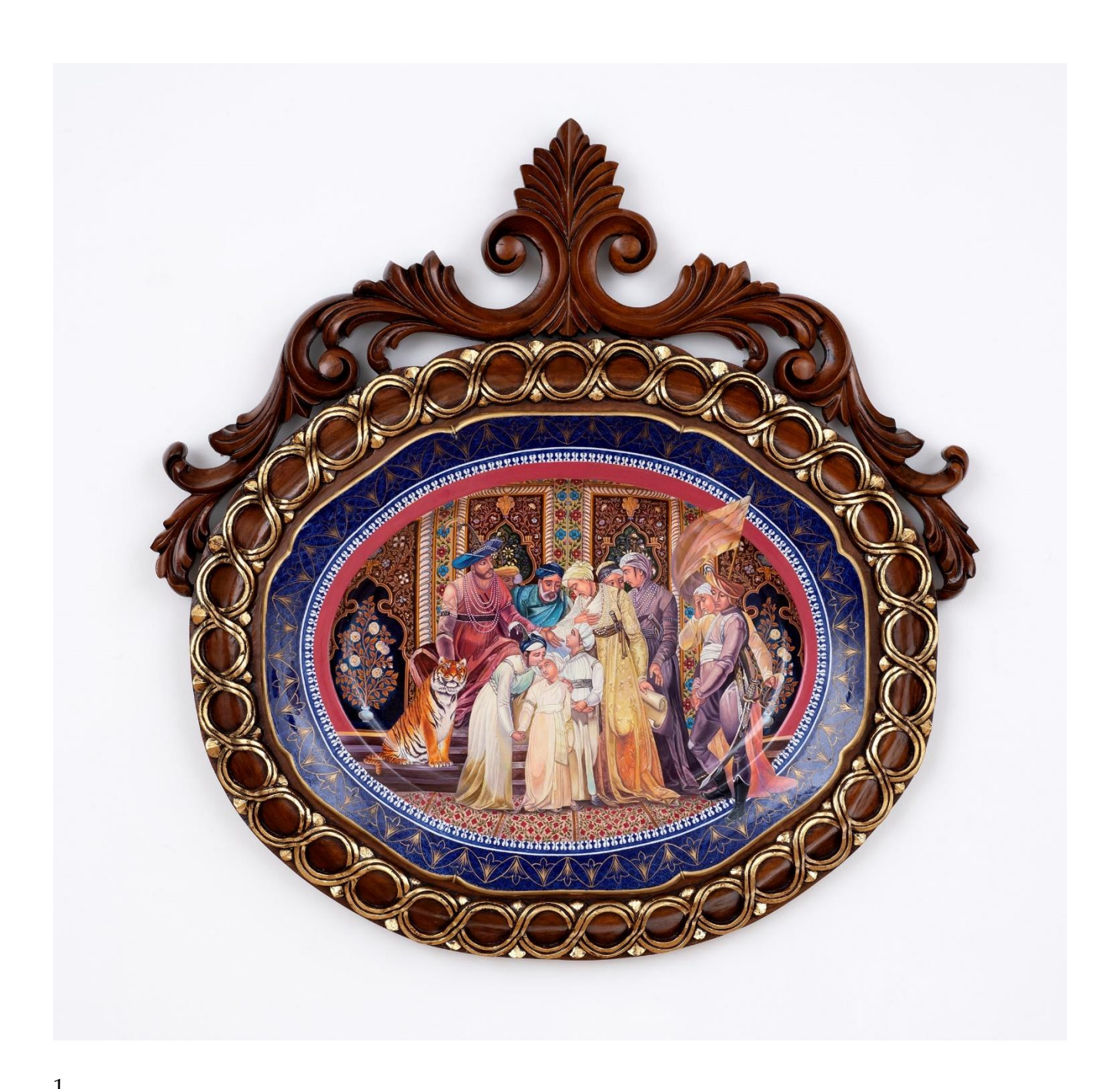
Tipu bids farewell to his sons at the court of Mysore, 2024

Found vintage ceramic plate, hand painted with enamel paint and lacquer Plate: 33.8 \times 41.9 cm ( 13\ 1/4 \times 16\ 1/2 in)