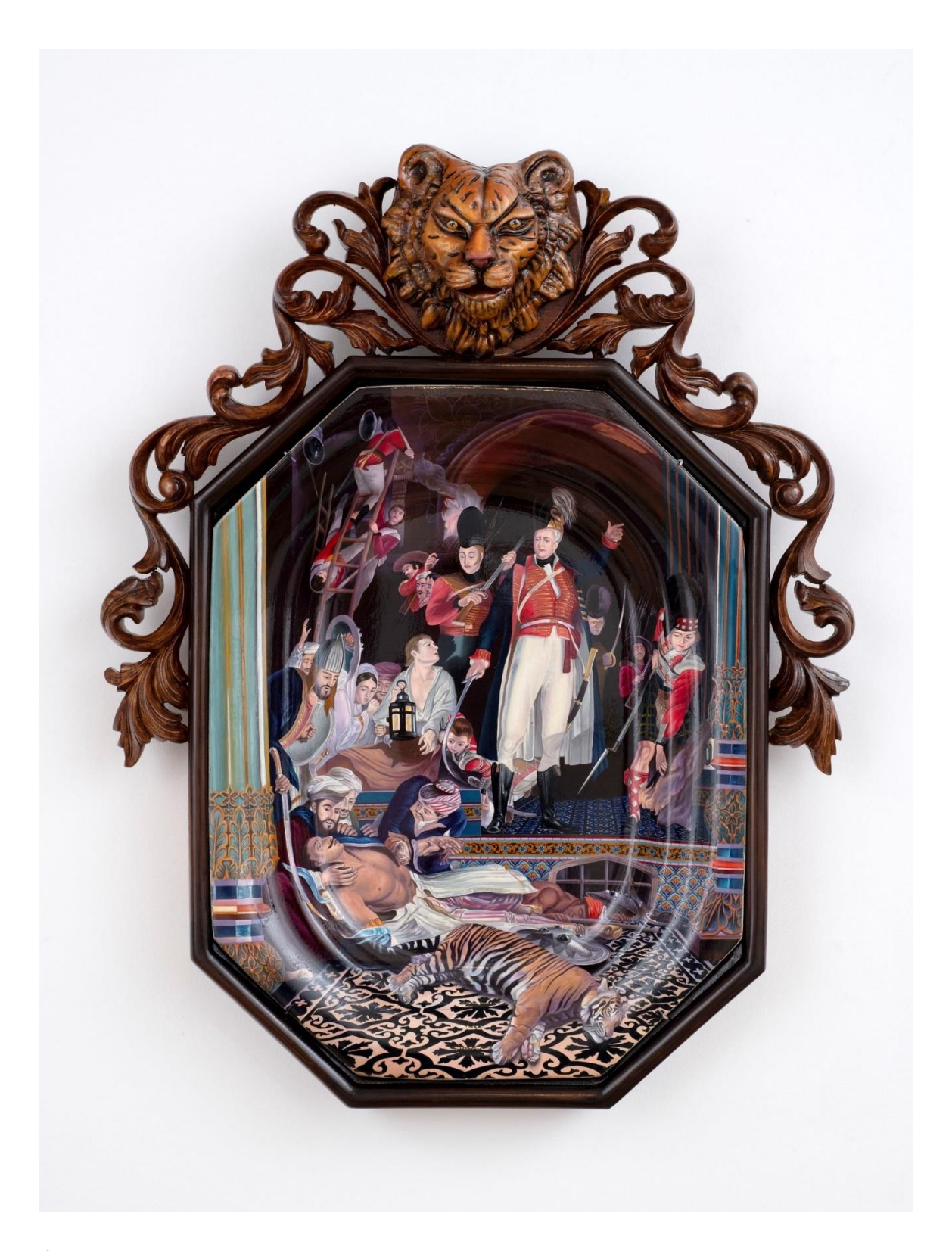
6. Tipu's body is discovered by Sir David Baird in the ruins of Seringapatam in 1799, 2024

Found vintage ceramic plate, hand painted with enamel paint and lacquer Plate: 54.6 \times 41.9 \text{ cm} (21 1/2 x 16 1/2 in)