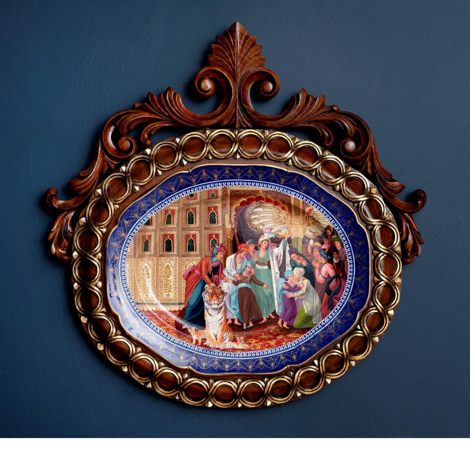
3. Tipu's sons bid farewell at the zenana harem, 2024

Found vintage ceramic plate, hand painted with enamel paint and lacquer