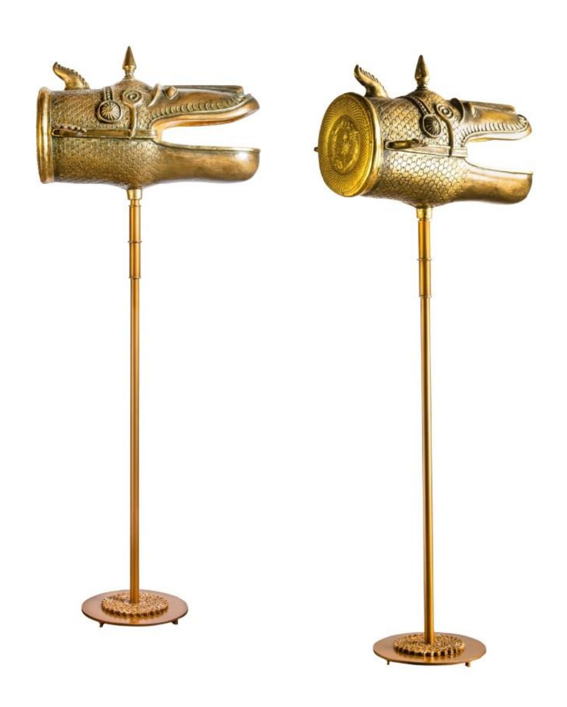
9. Honouring Tipu: Mahi Maratib battle standard, 2024

Brass dust, cast resin, oil and gold leaf Head: 50.8 \times 63.5 \times 59.7 cm ( 20 \times 25 \times 23 1/2 in) each With stand: 162 \times 50 \times 64 cm ( 63 \times 3/4 \times 19 \times 3/4 \times 25 \times 1/4 ) in each (Sold as a pair)