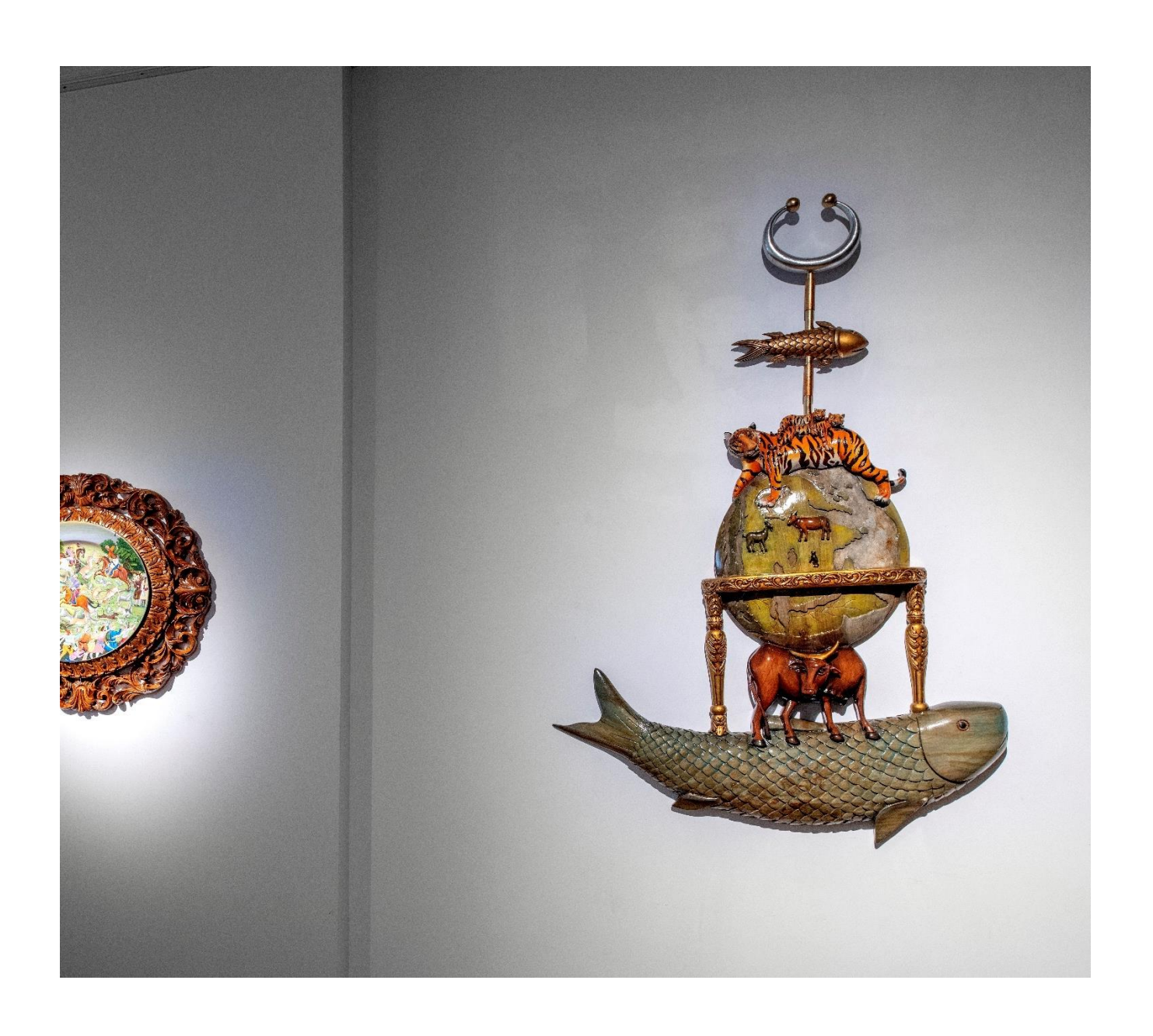
7. Honouring Tipu: Allegorical battle standard, 2024

Carved wood, wood polish, emulsion, oil paint, gold leaf and lacquer 152.4 x 106.7 cm 60\,\mathrm{x}\,42 in