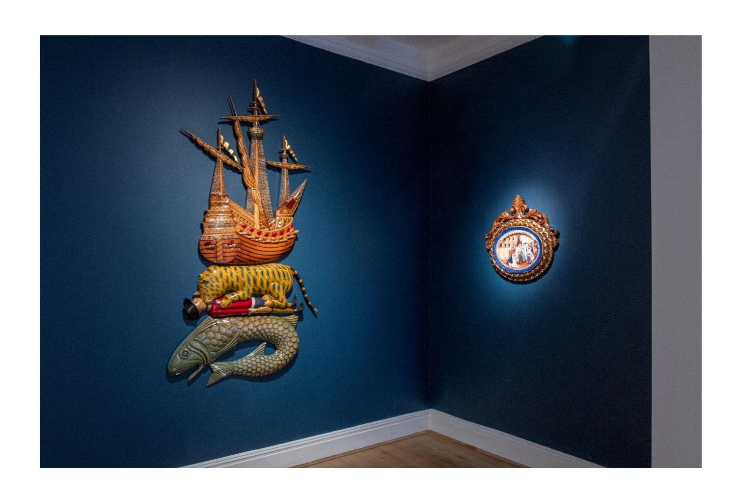
8. Remembering Tipu: An allegorical tribute to Tipu's last standard at Seringapatam, 2024

Carved wood, wood polish, emulsion, oil paint, gold leaf and lacquer 203.2 \times 104.1 \text{ cm} 80 \times 41 \text{ in}