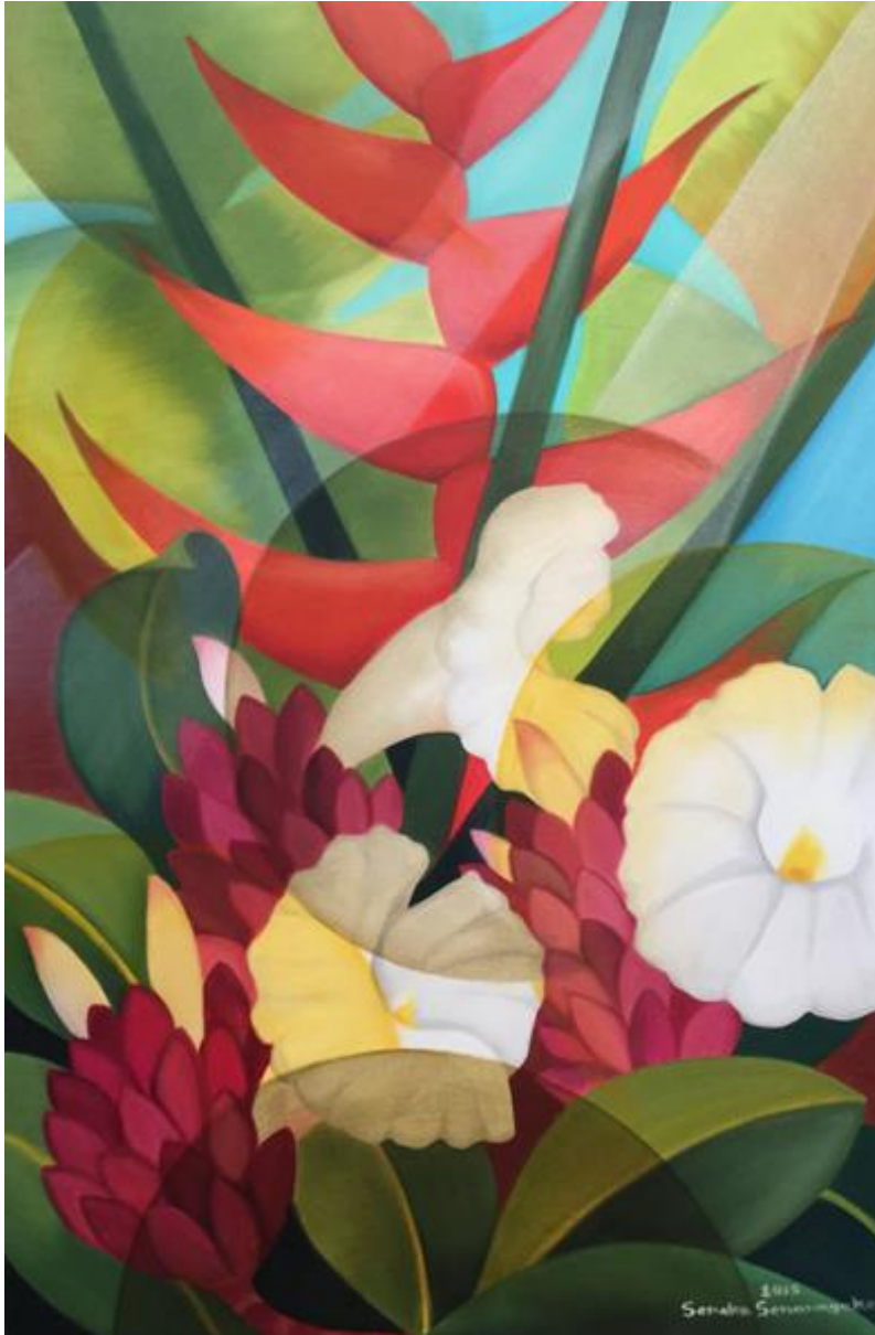
4. My Garden , 2015 Oil on canvas 91.4 x 60.9 cm. (36 x 24 in.)