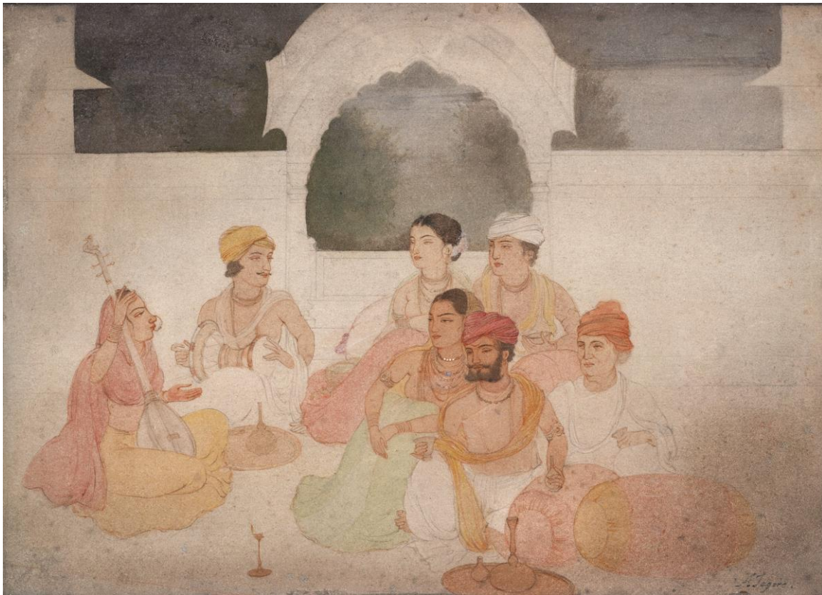
Abanindranath Tagore, A Moonlight Music Party (Circa 1903)

For further details and high-resolution images please contact the gallery.