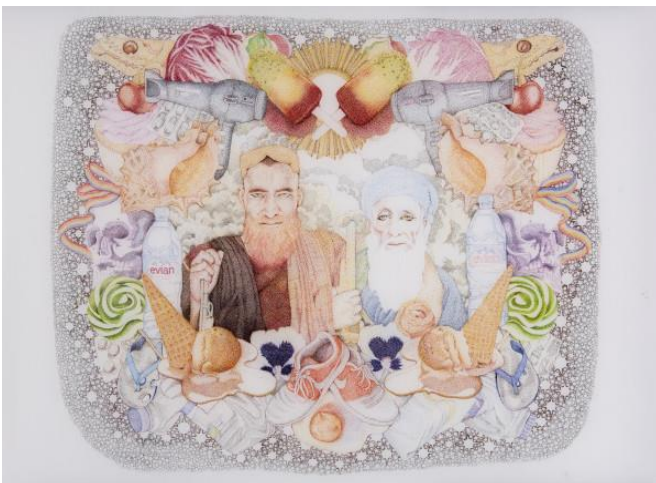
Get out of my Dreams 5 (2020) Ink on polyester film, 63.5 x 84 cm