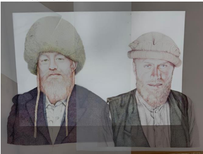
Work in progress (2025)