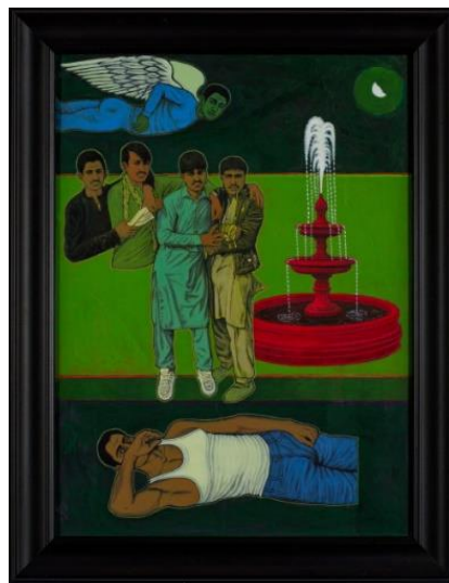
Wandering Spy Angel (2025) Acrylic and collage on plywood, 48 x 35 cm

For further details, interviews, or high-resolution images, please contact: art@grosvenorgallery.com